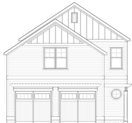
Road side elevation