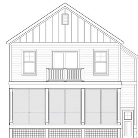
Lake side elevation